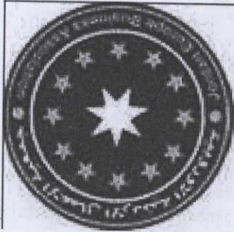
Jordan Europe Business Association (JEBA)